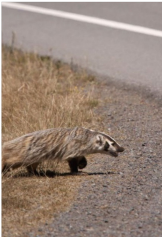
Aug 9/18 Badger seen on highway to Morden, MB 25kms west of town. Need to be aware of wildlife.