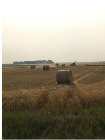
Aug 8/18 Hydrovac daylighting hotlines for RoW at Road #4 KP 1006+200