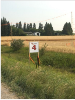
Aug 8/18 Road #4 KP 1006+000