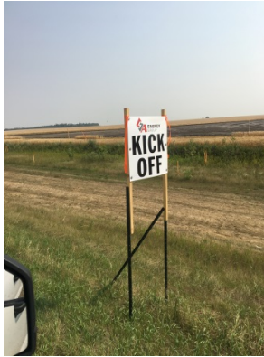
Aug 11/18 Spread 9 Kick Off site Highway 244 and mile road 21 north