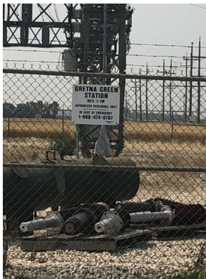
Aug 11/18 Auger at Gretna Station in Gretna, MB