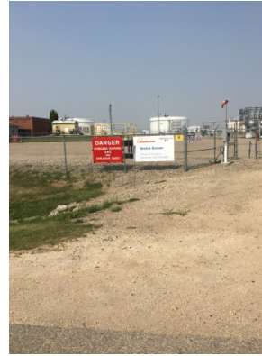
Aug 11/18 Gretna, MB-End of Spread 9